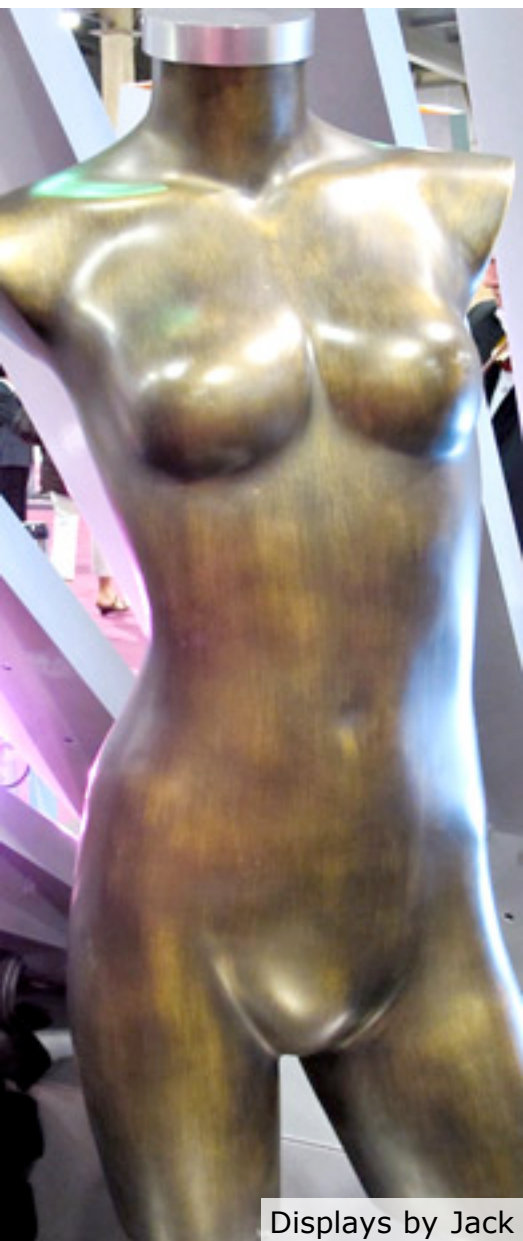
Displays by Jack